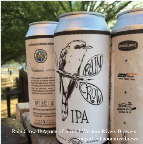
Rain Crow IPA, one of several Western Rivers Brewers' Council collaborative brews

Craft beer depends on reliable water, and so do our rivers