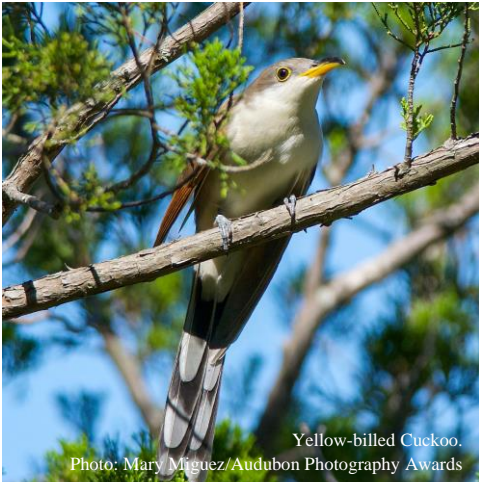
Yellow-billed Cuckoo.