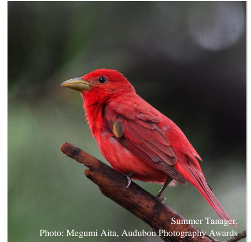
Summer Tanager.