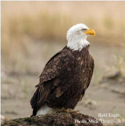
Bald Eagle.