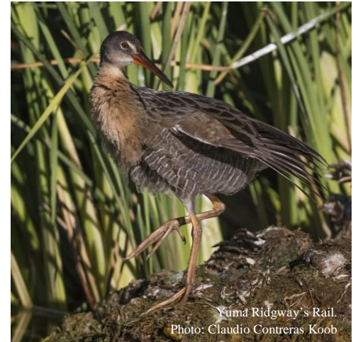
Yuma Ridgway's Rail.