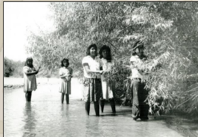
Photos circa 1930, courtesy Huhugam Heritage Center and Ramsey collection.