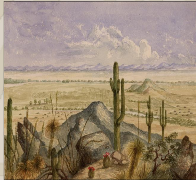
John Russell Bartlett, 1852, original in the John Carter Brown Library at Brown University

BIA Pima Agency Wildland Fire GRIC Huhugam Heritage Center