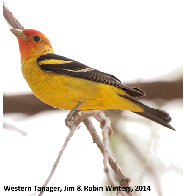
Western Tanager